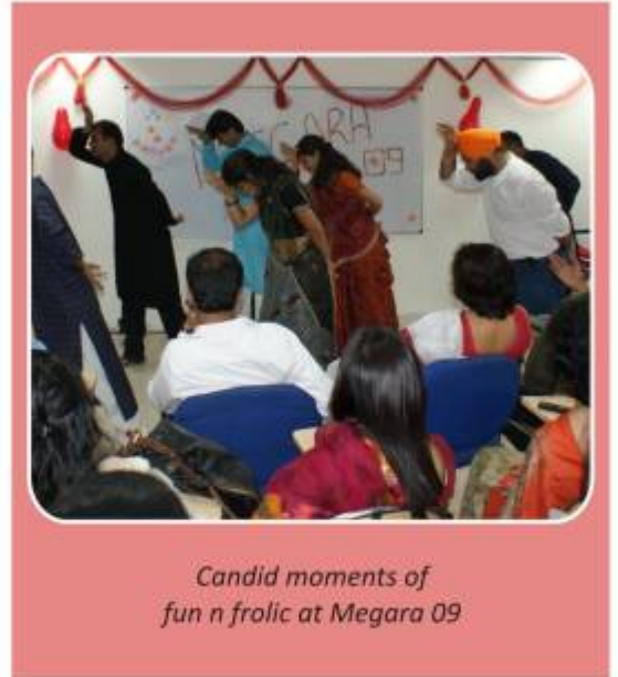
Candid moments of fun n frolic at Megara 09

Activities: Welcome song, Dance tapping numbers, skit, Fashion Show, Dumb charades, Quiz sessions...showcased creativity of every participant in one way or the other