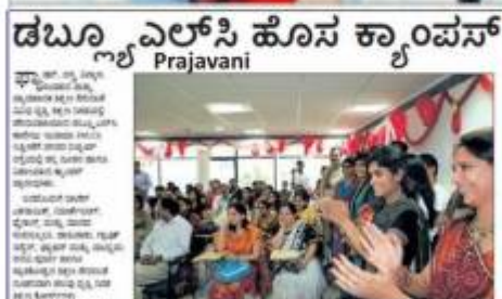
ಡಬ್ಲ್ಯೂ ಎಲ್ ಸಿ ಹೊಸ ಕ್ಯಾಂಪಸ್ ಪ್ರಜಾವನಿ