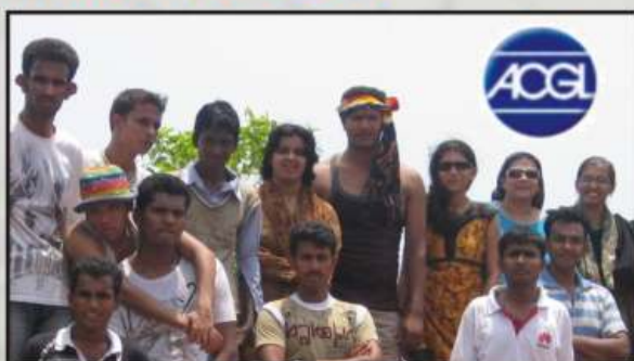
WLCI Hubli students Visited ACGL Goa Ltd as a part of their practical teaching modules.