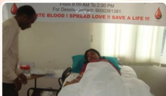
Volunteers at Blood Donation Camp