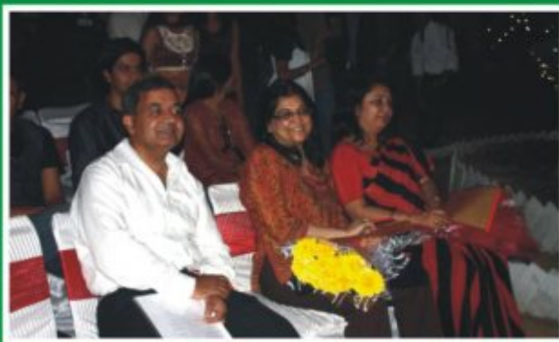
'Atomic Night' @ Sainik Farms