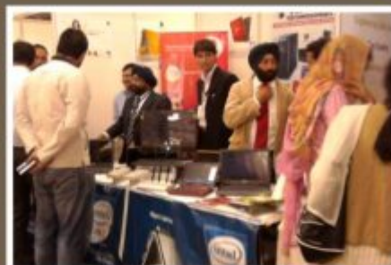
Students in action at ICT Expo 2009