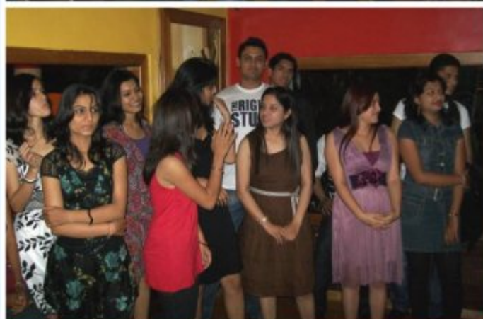
Time of 'their' life!

All for our new entrants to WLC family! These were the sentiments which got shared amongst the senior and junior batches of WLC Pune. The efforts put in by the students of PCL were valued to a great extent by the Freshers. The venue selected was one of the most famous and exotic location called HIGH SPIRITS in Koregaon Park.