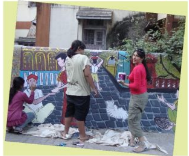
PAINTING FOR A CAUSE...