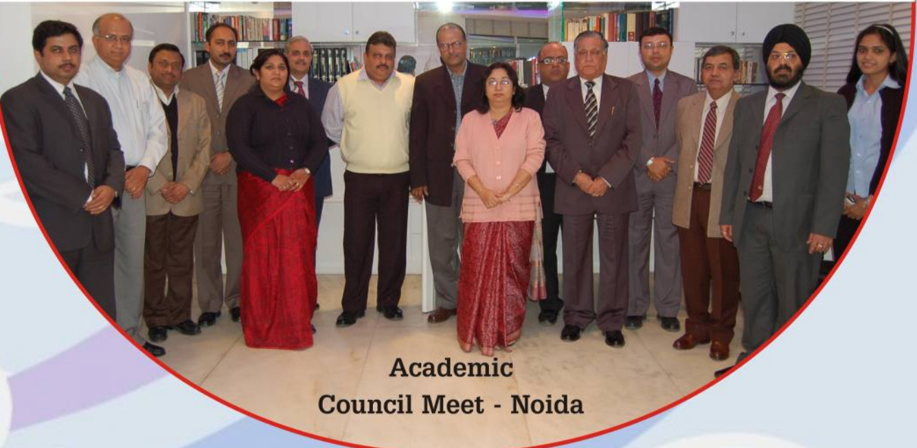
Academic Council Meet - Noida

BUZZ-DID YOU KNOW? The "sixth sick sheik's sixth sheep's sick" is said to be the toughest tongue twister in the English language.