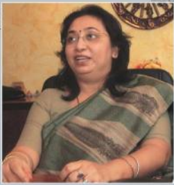
Employers' Council Meet - Delhi