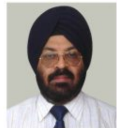
Editor in Chief, WLCI Buzz