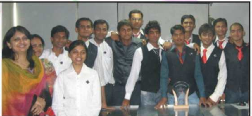
A Token of Success, Students Noida Camp