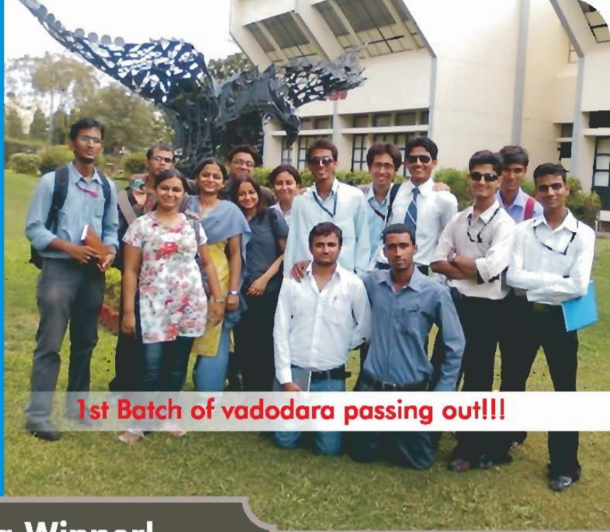
1st Batch of vadodara passing out!!!